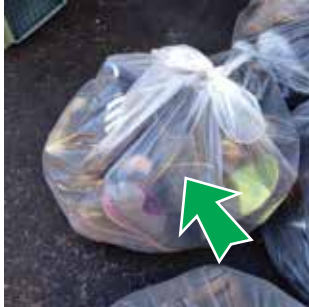
• Rubber band or tie together