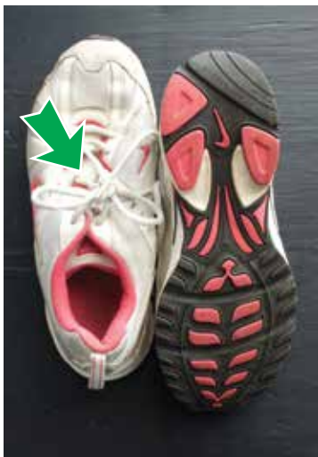
• Laces intact, lots of life left