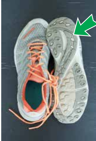
•Clean, good condition