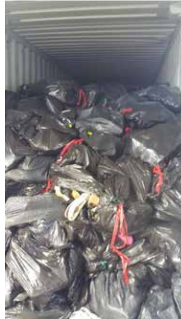
• Black unapproved bags