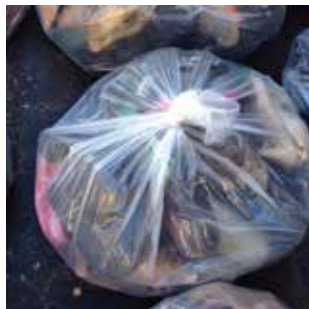
• Clean, gently worn, used or new shoes