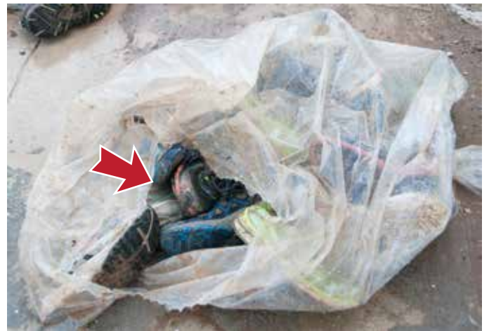
• Wet and not bound together