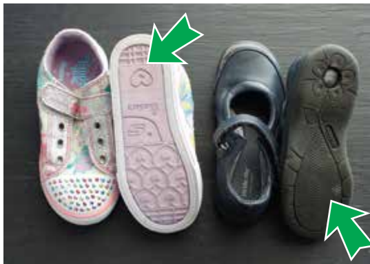
•Still wearable, clean, good condition