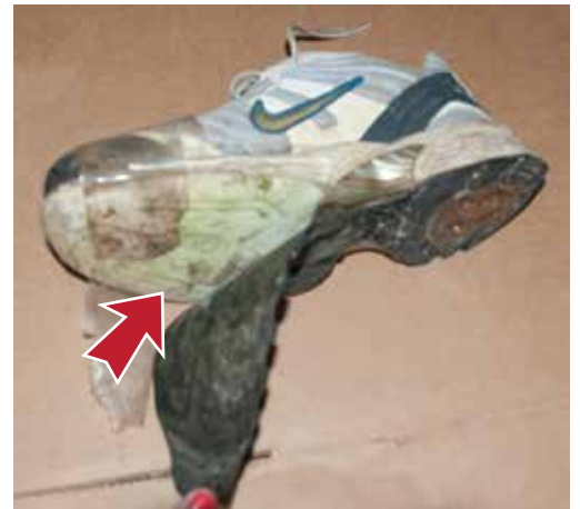
• Sole is falling off. Not in wearable condition.