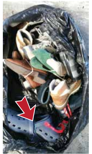
• Not rubber banded or tied